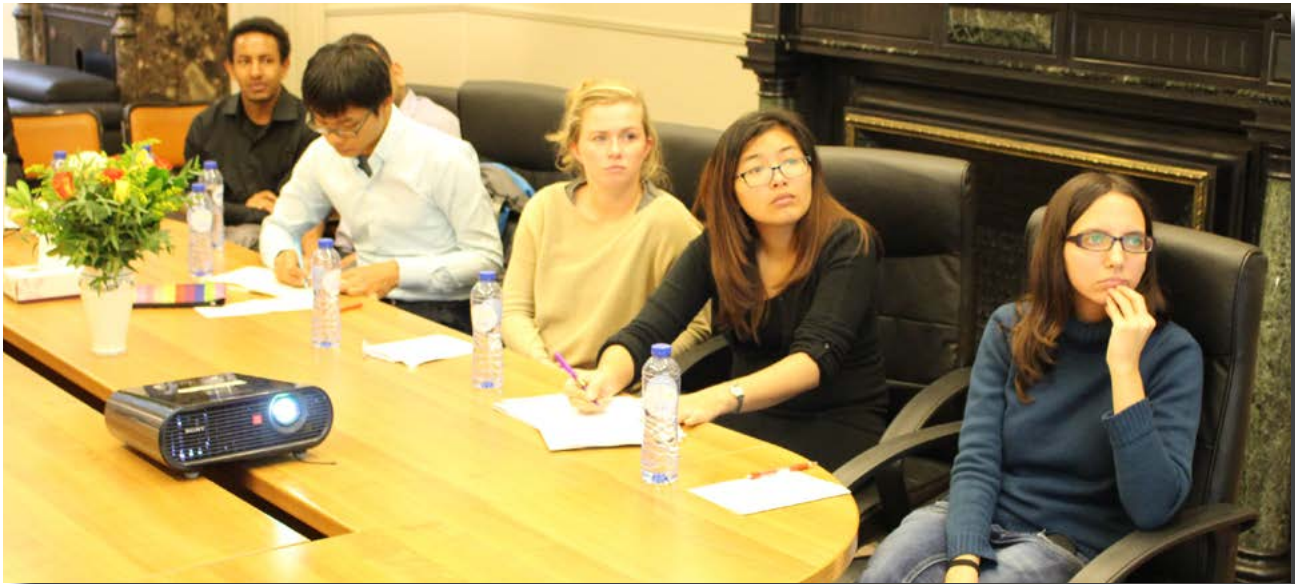
Graduate students from the KU Leuven University during a briefing, this week at the Embassy