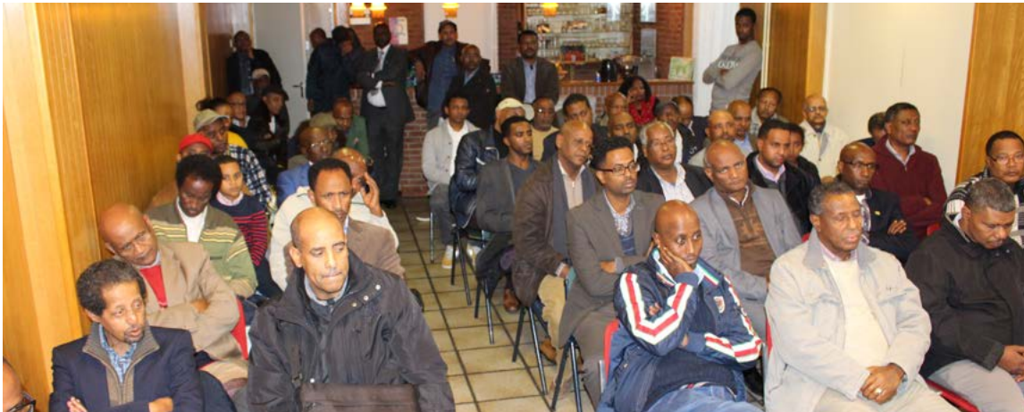
Meeting with GERD Council Members in Rotterdam, on Sunday the 15 th on November 2014