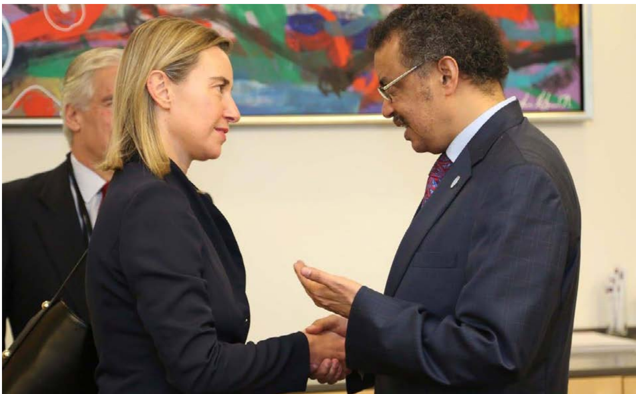
Ethiopian Foreign Minister and EU High Representative on Wednesday in Copenhagen

On Tuesday, the Ethiopian Foreign Minister had held talks with Danish Foreign Policy and Foreign Affairs Committee Chairperson, Mette Gjerskov. Dr Tedros briefed Ms. Gjerskov on Ethiopia's great efforts to help solve the crisis in South Sudan peacefully, and also on socio-economic and political developments over the last two decades. He also explained the Government's efforts to ensure active participation of communities and of women at grass roots level across the country. Ms. Gjerskov said she appreciated the Ethiopian government's commitment and efforts to develop security and integration with the Horn of Africa, and noted its active participation in UN, AU and IGAD activities to help maintain peace and security. She promised the Danish people's continued support for Ethiopia's effort to realize development, democracy and peace.