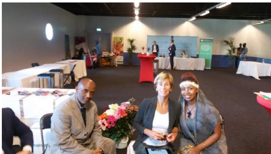
Netherlands Ambassador to Ethiopia Lidi Rimmelzwaal with a diplomat from our Embassy and an Ethiopian participant during the "Africa Works!" conference