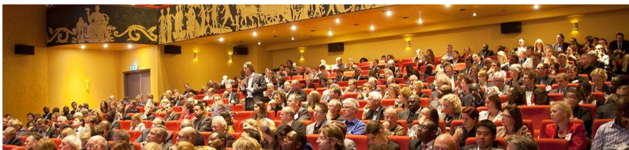
Participants at Africa Works, 2012 edition

The conference was held in Leiden (the Netherlands) on the 16th and 17th of October 2014 and was organized by the Netherlands-African Business Council (NABC) and the African Study Centre. This second edition of the conference had an ambitious goal: "connecting the business, knowledge, government and NGO sectors working in and with Africa". About 850 participants attended the event, which was supported by the Ministry of Foreign Affairs of the Netherlands and Rabobank.