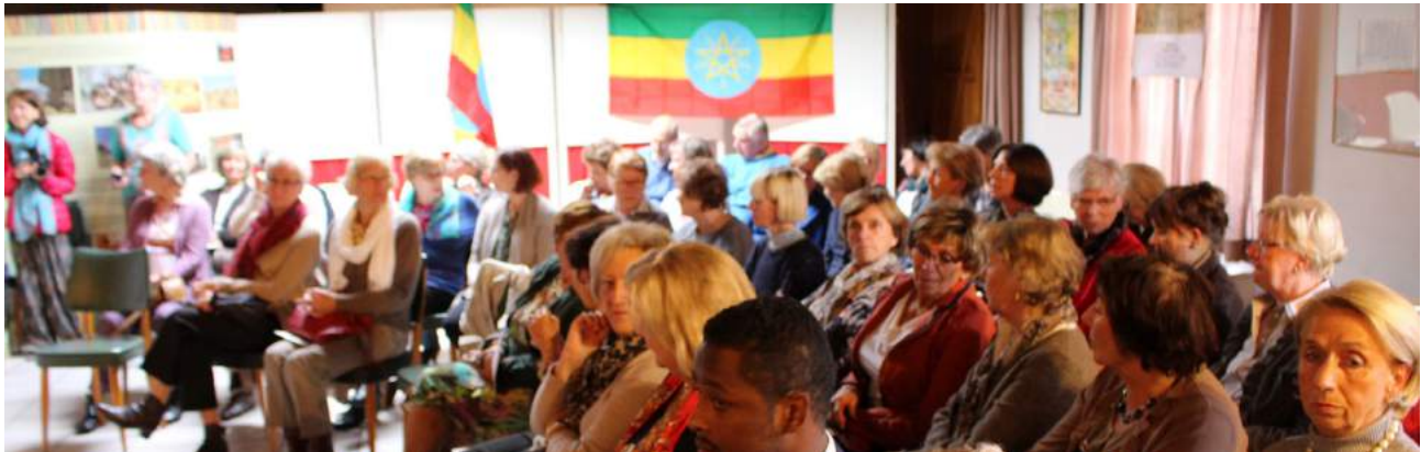
Participants attending the Ethiopia Day in Schilde, near Antwerp, on the 16 th of October 2014