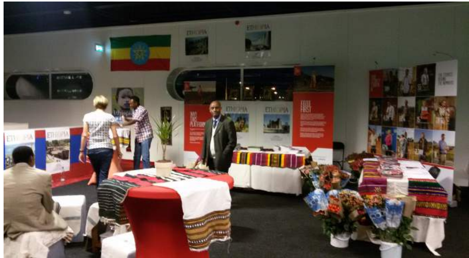
The Ethiopian Stand during the "Africa Works!" conference