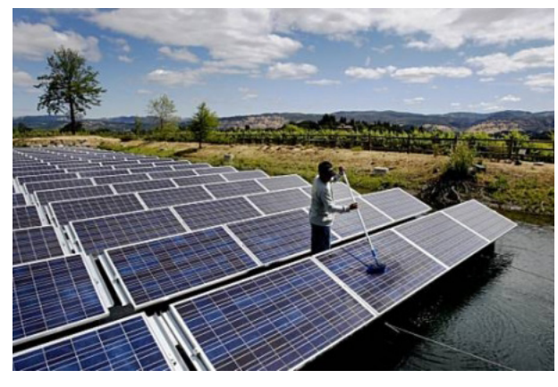
Photovoltaic installation in Ethiopia

The Ethiopian strategy and its willingness to initiate partnerships in this sector is bearing fruits. Ethiopia is for example working closely with the Gesellschaft für Internationale Zusammenarbeit (GIZ), the German Agency for International Cooperation. Together, they launched a Sustainable Land Management Programme in 2008. Interviewed by IPS News Agency, the representative of bilateral development cooperation at the Addis Ababa German Embassy showed much confidence regarding this commitment: "It is very well known by the international community that Ethiopia is one of the front-runners of international climate policy, if not the leading African country."