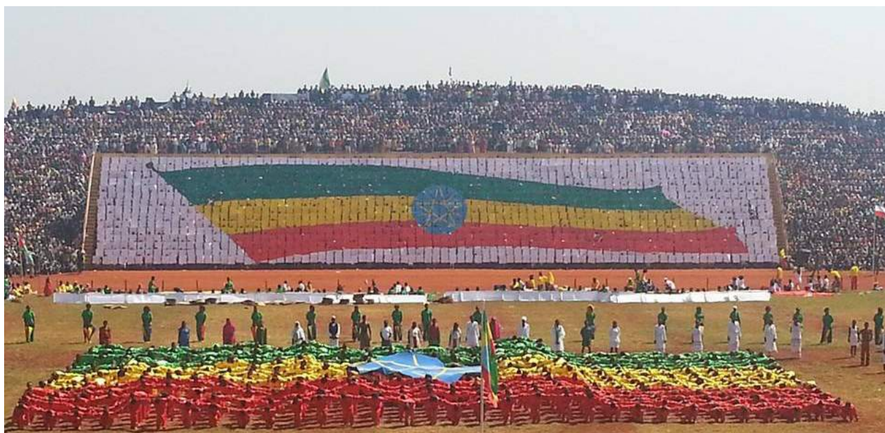
Nations, Nationalities and Peoples’s Day celebration in Benishangul Gumuz Regional State.

Addis Ababa, 8 December 2014 (WIC) – The 9th Ethiopian Nations, Nationalities and Peoples’ Day of was colorfully marked in Benishangul Gumuz Regional State today. The celebration was graced by the presence of President