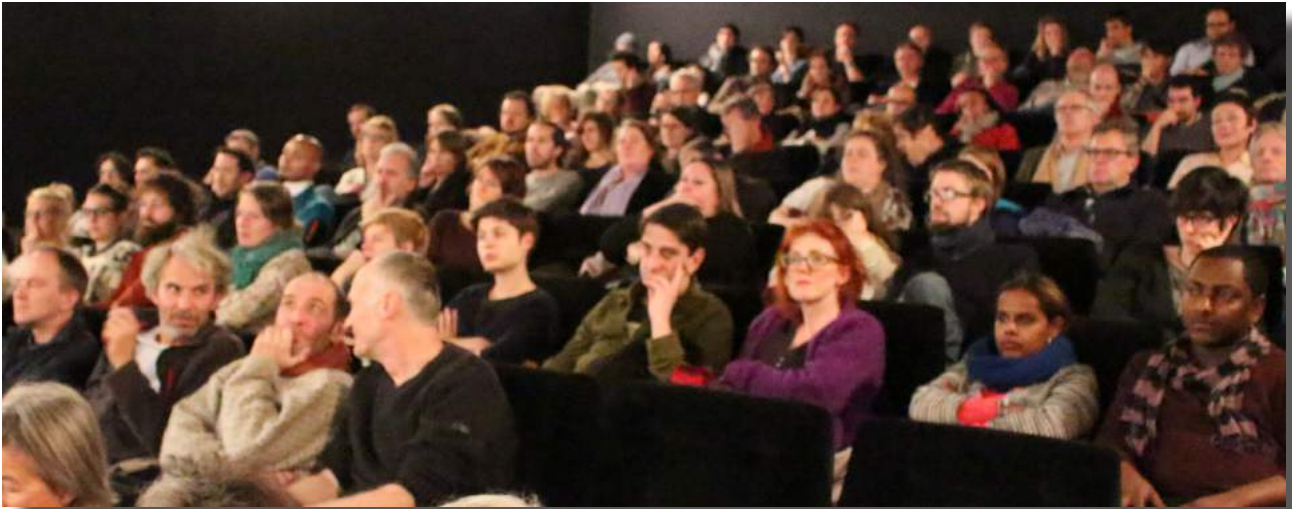
Premiere of the film "Shattering Shadows" in Brussels, on the 2nd of December 2014