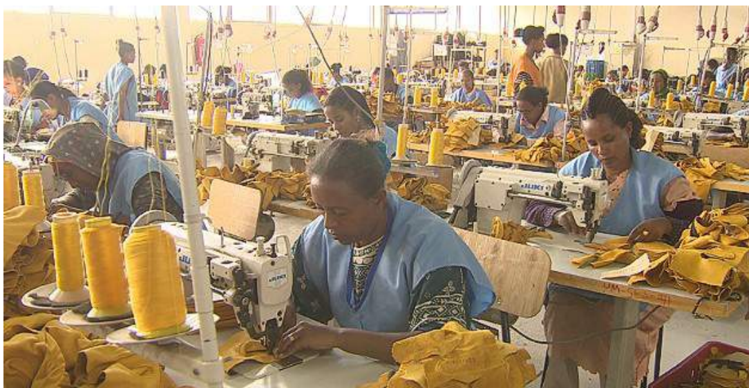
Glove factory in Ethiopia.

significant contribution for the raise in revenue, showing 31 and 23.62 per cent increase respectively compared to the same period the previous year, he said. Ethiopia envisaged earning 5 billion US dollars from export trade this budget year.