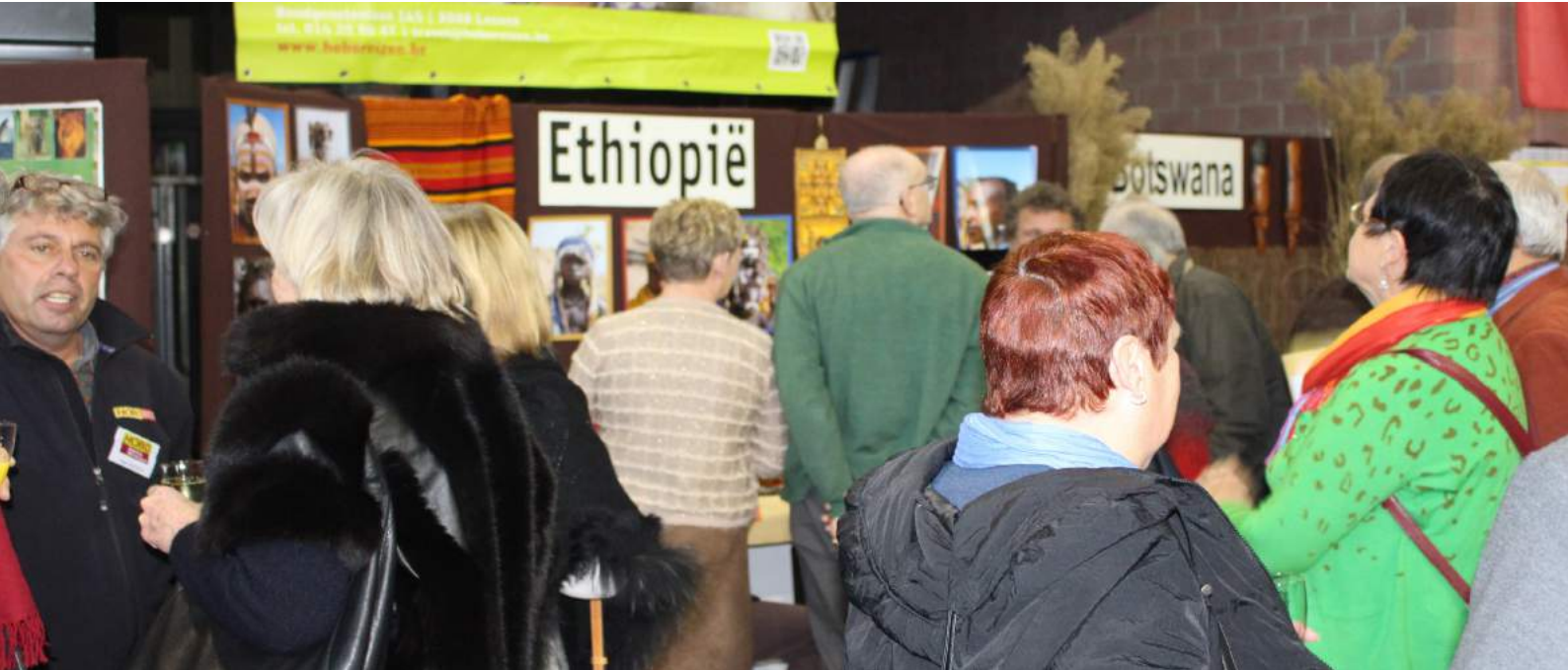
Visitors at the Tourism Fair in Leuven, last Sunday