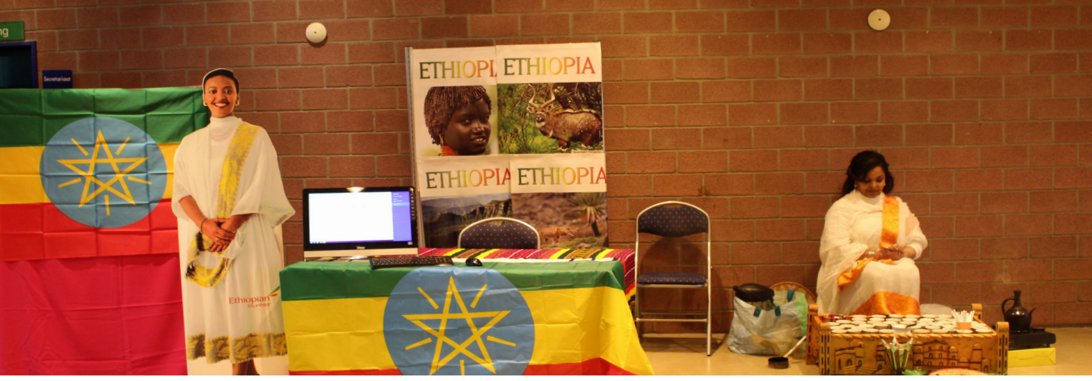
The stand of the Embassy at the Tourism Fair in Leuven, last week