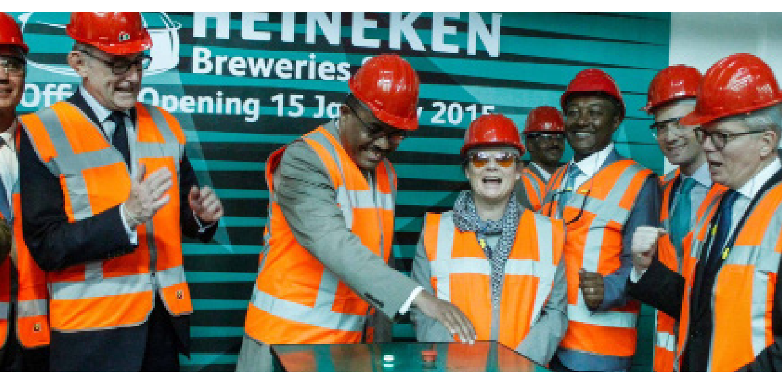
Ethiopian Prime Minister Hailemariam inaugurating the Heineken facility, on 15 January 2015

Heineken group opens a 110 million euros factory near Addis Ababa