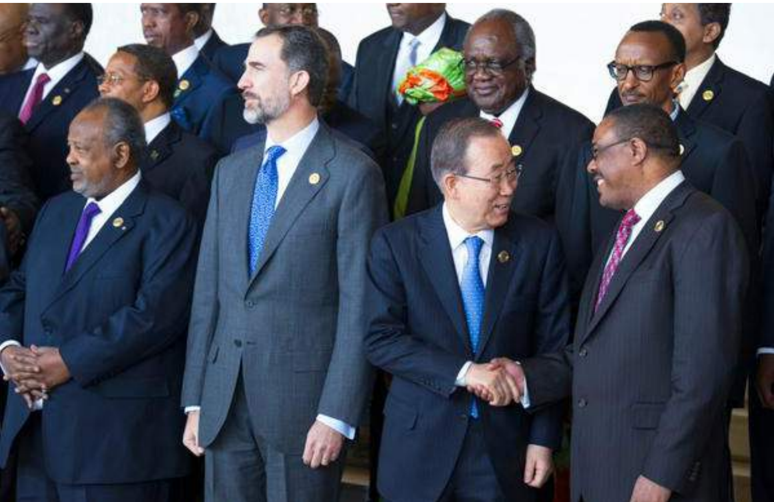
UN Secretary General Ban Ki-moon and Prime Minister Hailemariam at the 24th Ordinary Session, on 30 January 2015

Addis Ababa, 28 January 2015. More than 40 African heads of state and government and hundreds of delegates from across the world converged on Ethiopia's capital Addis Ababa to attend the 24th Ordinary Session of the Assembly of Heads of State and Government of Africa on Friday, 30 January 2015. The African Union said the Summit aims at discussing the theme of the year and also at reviewing the 2014 reports of the African Union. This year's session will be held under the theme "Year of Women Empowerment and Development towards Africa's Agenda 2063". The Summit will consider the adoption of Agenda 2063, a fifty-year shared strategic framework for inclusive growth and sustainable development on the African continent, and also discuss the role of NEPAD (New Partnership for Africa's Development) in this Agenda.