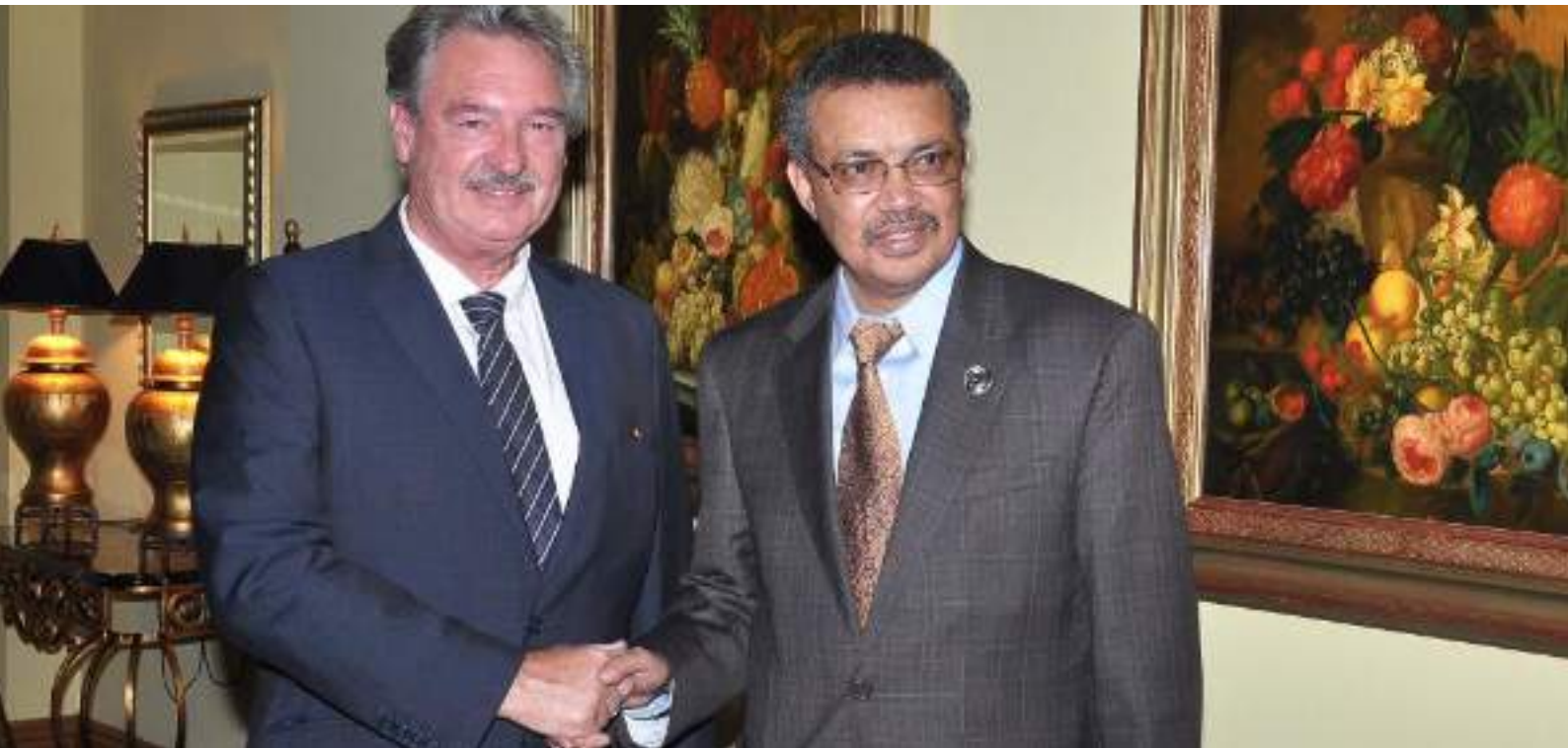
Jean Asselborn and Dr Tedros in Addis Ababa on 27 January 2015

Grand-Duchy of Luxembourg said that tremendous socio-economic and political progresses have been witnessed in Ethiopia. He also appreciated Ethiopia's eminent role in realizing peace in the Horn of Africa. The minister noted that Ethiopia and Luxembourg should work more in the areas of aviation, trade and generally