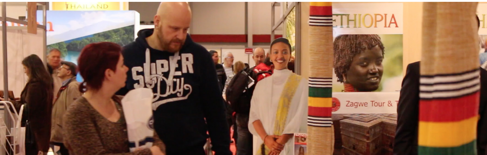
At the Ethiopian stand during the Salon des Vacances tourism fair, in Laeken, near Brussels, on 9 February 2015