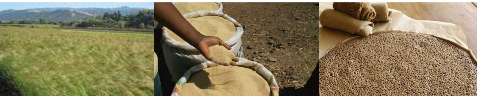
Teff growing (left), teff cereal (center), and injera (Ethiopian pancake made out of teff - right)

In an article published this week, Deutsche Welle analyzes the skyrocketing demand for teff, the Ethiopian traditional grain. The German online media is analyzing the global interest for this cereal as the quest for an alternative to the traditional cereals: teff is not only gluten-free and high in rich elements (calcium, iron), but can also be used to make any flour-based food such as bread, pasta, tortillas and cookies.