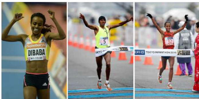
From left to right: Genzebe Dibaba , Endeshaw Negesse and Birhane Dibaba