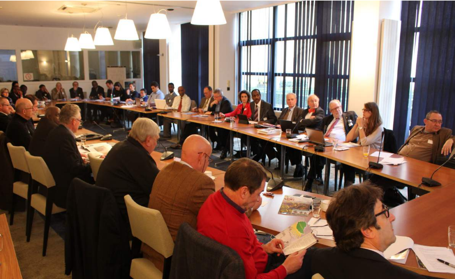
Round table with investors at CBL-ACP in Brussels, this Monday

be organized soon by CBL-ACP in cooperation with the Ethiopian Embassy in Brussels. To get more information, please get in touch with CBL-ACP on http://www.cblacp.eu .