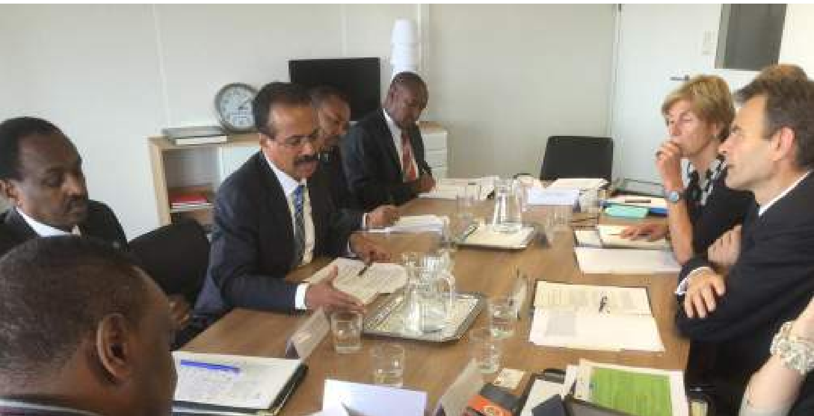
Ethio-Dutch political consultations at the Netherlands Ministry of Foreign Affairs

On the 5th to 6th of March 2015, the second Ethio-Dutch political consultation was held at The Hague Netherlands Ministry of Foreign Affairs. The political consultation was opportunity to further strengthen political and economic relationships between the two countries, to address bilateral, multilateral issues as well as investment, trade, tourism and regional cooperation. The invigorated