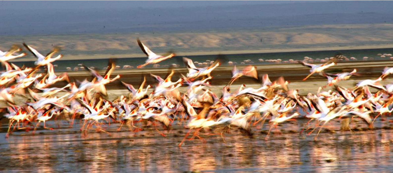
Flamingos at Lake Abijata, in Ethiopia