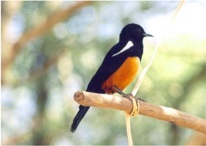
Mocking cliff chat

enable the visitor to enjoy the country's scenery and its wildlife, conserved in natural habitats, and offer opportunities for travel adventure unparalleled in Africa. In short, travelers looking to discover new landscapes, animals and plant species should not hesitate: Ethiopia's wildlife has much to offer.