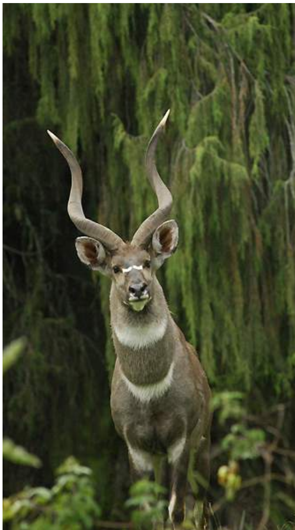
Mountain Nyala found in the Simien Mountains

Besides of the Elephants and Abyssinian lions, there are a number of charismatic and endemic "flagship" species in Ethiopia, most notably the Gelada Baboon (an endemic genus and the world's only grazing primate), which can be found in the Simien Mountains. His friendly attitude towards tourists make him easy to observe. The Mountain Nyala (Simien Mountains), the extremely rare Ethiopian Wolf (Red Fox), the