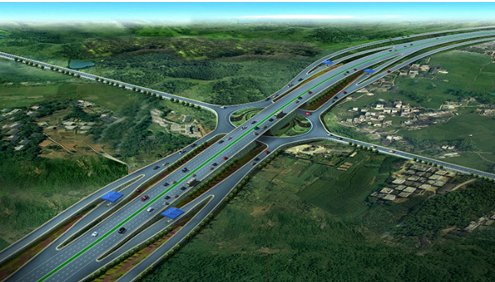
A new expressway will connect the capital city Addis Adaba to Adama.

to the World bank, the number of rural people with access to an all-season road nearly tripled in the last five years, with an increase to 36.5 million in 2014 from 12.5 million in 2009. Several highways have also been completed, among other the Ethiopia-Sudan highway, while other highways connecting Ethiopia respectively to Kenya, Djibouti and South-Sudan are under construction.