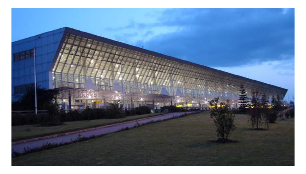
Addis Ababa Bole Airport.

considerable: the mostly asphalted road network is almost three times larger than in 1997, the railway network is transforming the landlocked country into an interconnected economy, the telecom services are expected to cover 85 percent of the country