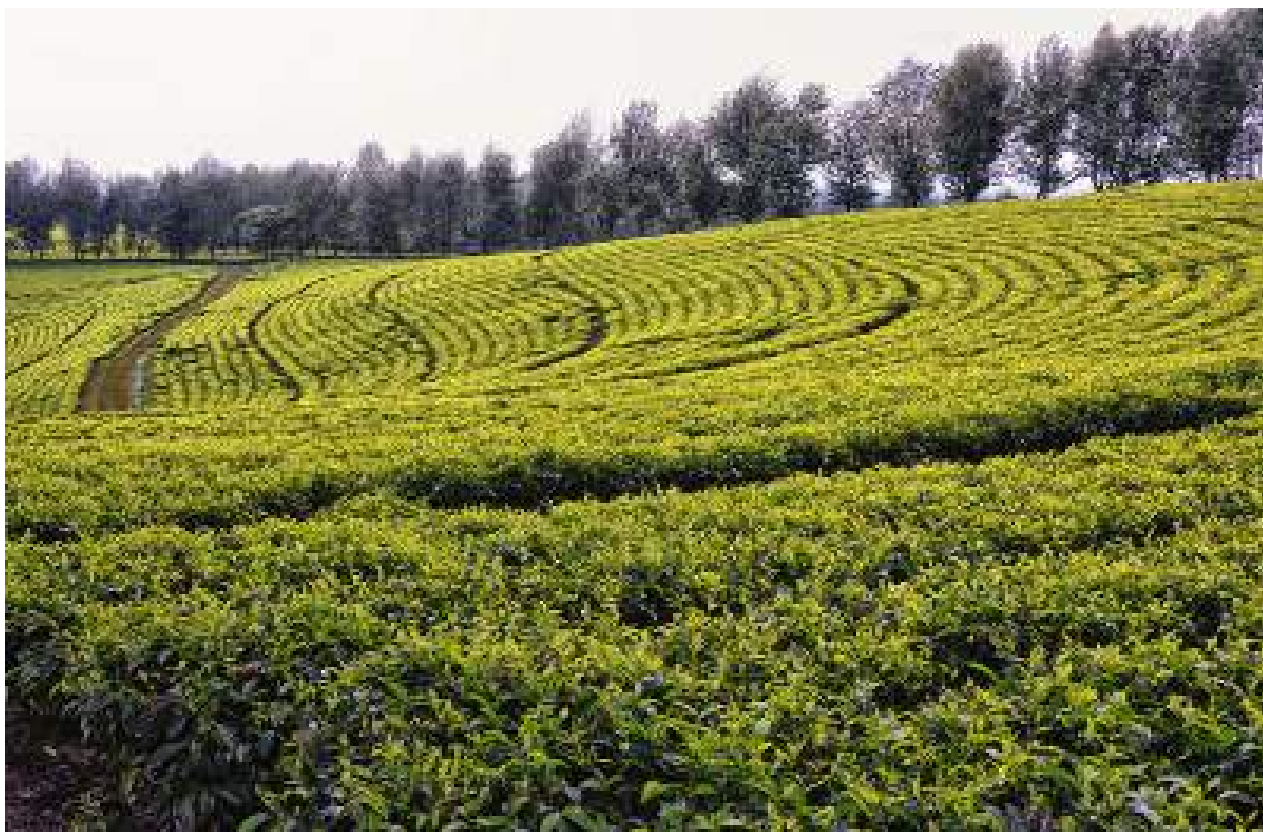
Tea fields in Ethiopia.

agricultural investments and assist the nation in lifting itself out of poverty. Promoting an equitable benefiting of the youth and women will be highlighted in line with rapid rural development.