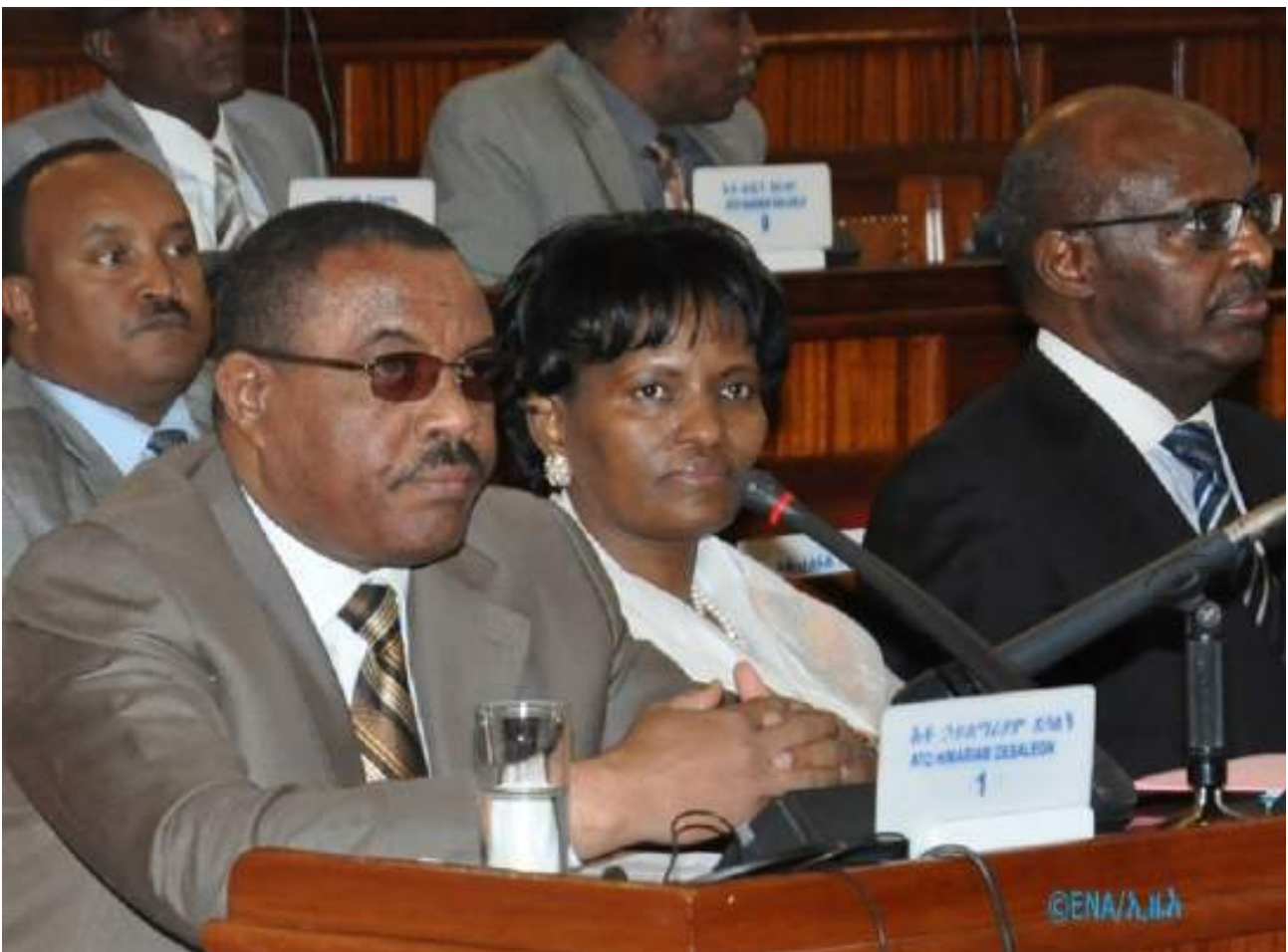
Prime Minister Hailemariam Desalegn on 7 July 2015.

On 7 July 2015, the Prime Minister of the Federal Democratic Republic of Ethiopia addressed the House of People’s Representatives to approve the yearly budget and the annual reports in political, social and economic issues. In his remarks, the Premier underlined the progresses