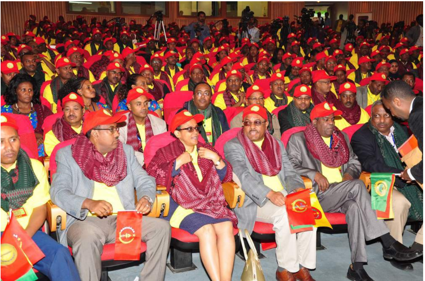
EPRDF 10th regular congress in Mekele.

The 10th Ethiopian People's Revolutionary Democratic Front (EPRDF) congress took place from 28 to 31 August 2015 in Mekele, Tigray. The 180 members of the EPRDF Council re-elected Prime Minister Hailemariam Desalegn as Chairperson and Demeke Mekonnen as Deputy Chairperson of the front.