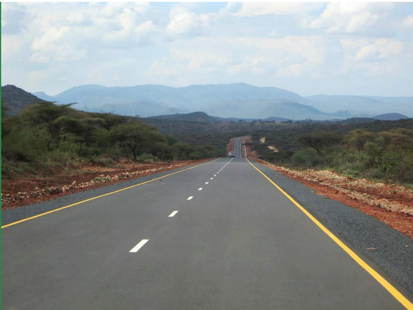
Ethiopia-Kenya Highway, Deritu, Oromia, Ethiopia.