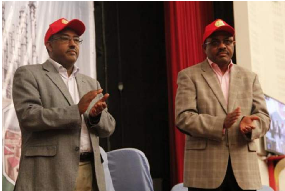
EPRDF Chairperson Prime Minister Hailemariam Desalegn and Demeke Mekonnen, EPRDF Deputy Chairperson

the group complained that an official sacked for its rent seeking behavior in one part of the country is re-assigned in other part of the country. They said that corrupt officials are in a kind of organized and chained benefit sharing mechanisms established across the public bureaucracy command chain. The participants in this particular group have also underscored the fact that the general public has been suffering from such organized group maladministration. Furthermore, they said though EPRDF has publicly acknowledged rent