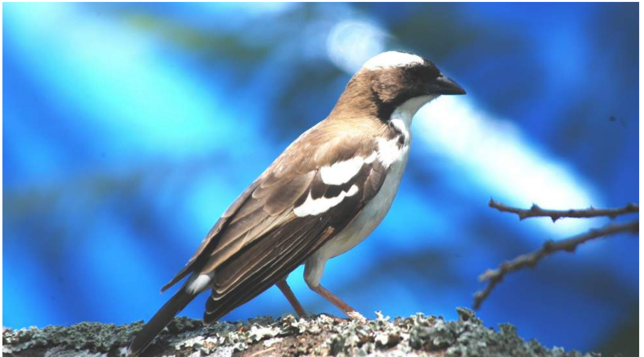
Chinspot Batis.