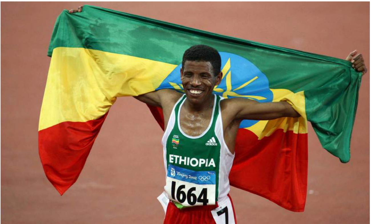
Haile Gebrselassie at the 2002 Beijing Olympic Games

Ethiopian athletes who hoisted their country's flag high in various international competitions said the flag is an embodiment of their national identity.