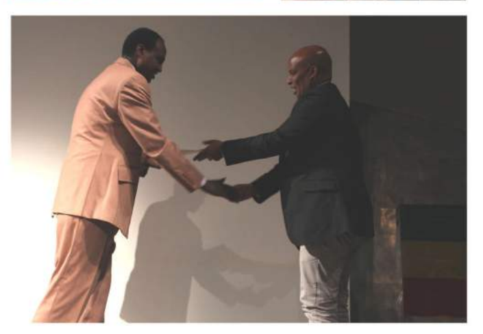
Highlights from the colorful celebration on 24 October 2015 in Brussels.