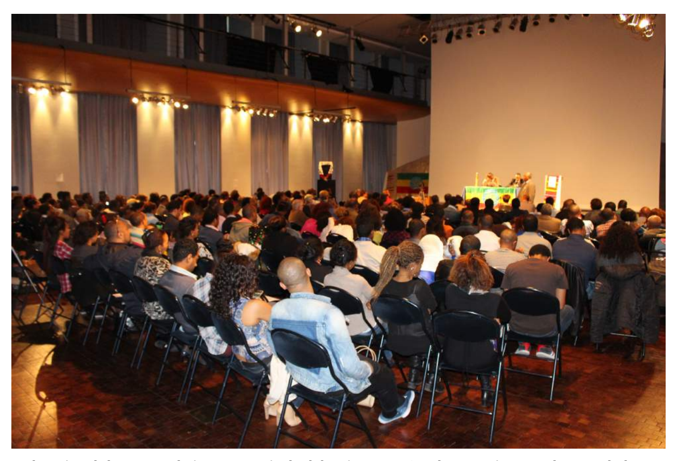
8th National Flag Day and Diaspora Festival celebration on 24 October 2015 in Brussels, attended by more than 300 members of the Ethiopian diaspora in the Benelux.